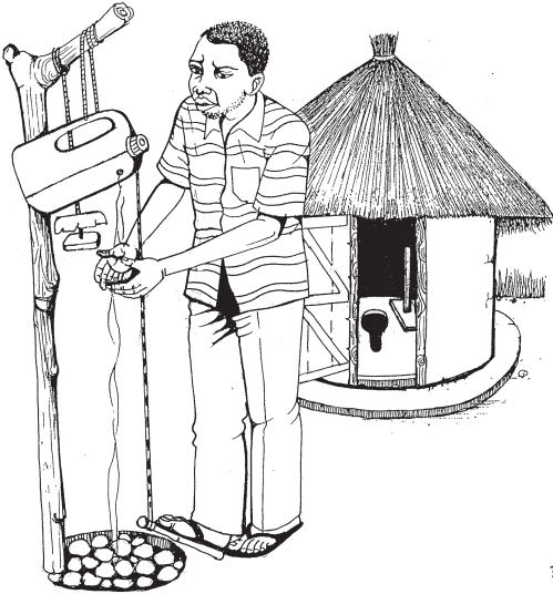
Water and soap (or ash) near latrine