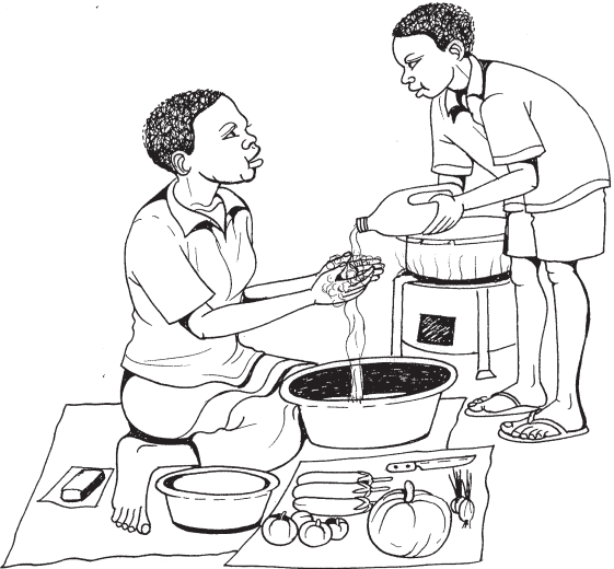
Water and soap (or ash) near cooking and eating area